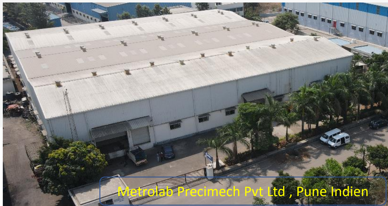
Metrolab Precimech Pvt Ltd , Pune Indien