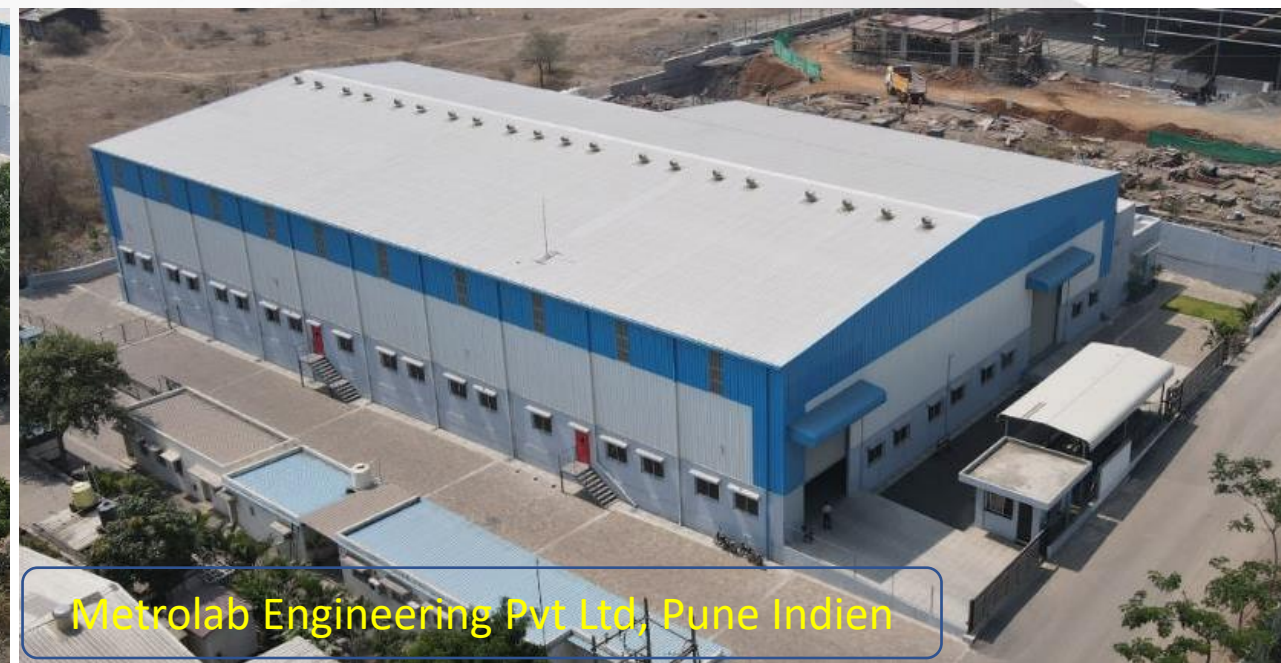
Metrolab Engineering Pvt Ltd, Pune Indien